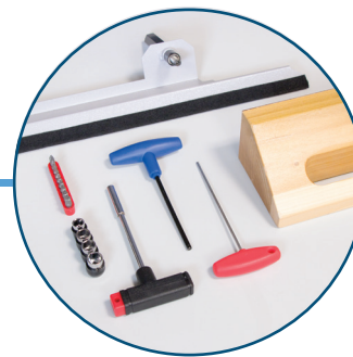
Blade Safety Tool Kit Change blades safely and easily, and make adjustments