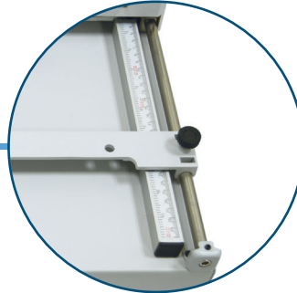
Calibrated Scale Allows for fine adjustments in both inches and metric