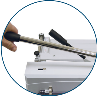
Two-Handed Cutter Arm for Safety Using two hands keeps them away from the cutting blade

The Cut-True 13M Tabletop Paper Cutter is rugged and compact with a hardened steel blade, LED Laser Line for precision cutting with minimal effort, and a variety of safety features. The back gauge and calibrated scales allow operators to make fine adjustments, while the Laser Line shows exactly where the blade will cut, making crisp accurate cuts every time. The Cut-True 13M also includes safety features like front and rear transparent covers, blade lock, external blade depth adjustment, and easy-to-use blade changing handles. It cuts stacks up to 5/8" high and is ideal for small print shops and others who want to produce professional-quality brochures, invitations and more.