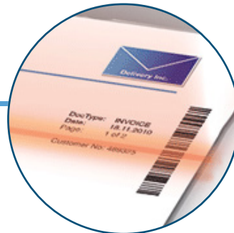
Optional Full-Page CIS Scanner Reads OMR, 1D, and 2D BCR codes printed horizontally or vertically