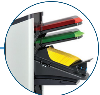
Optional Production Feeder Holds up to 325 BREs or 1,200 inserts up to 6" long