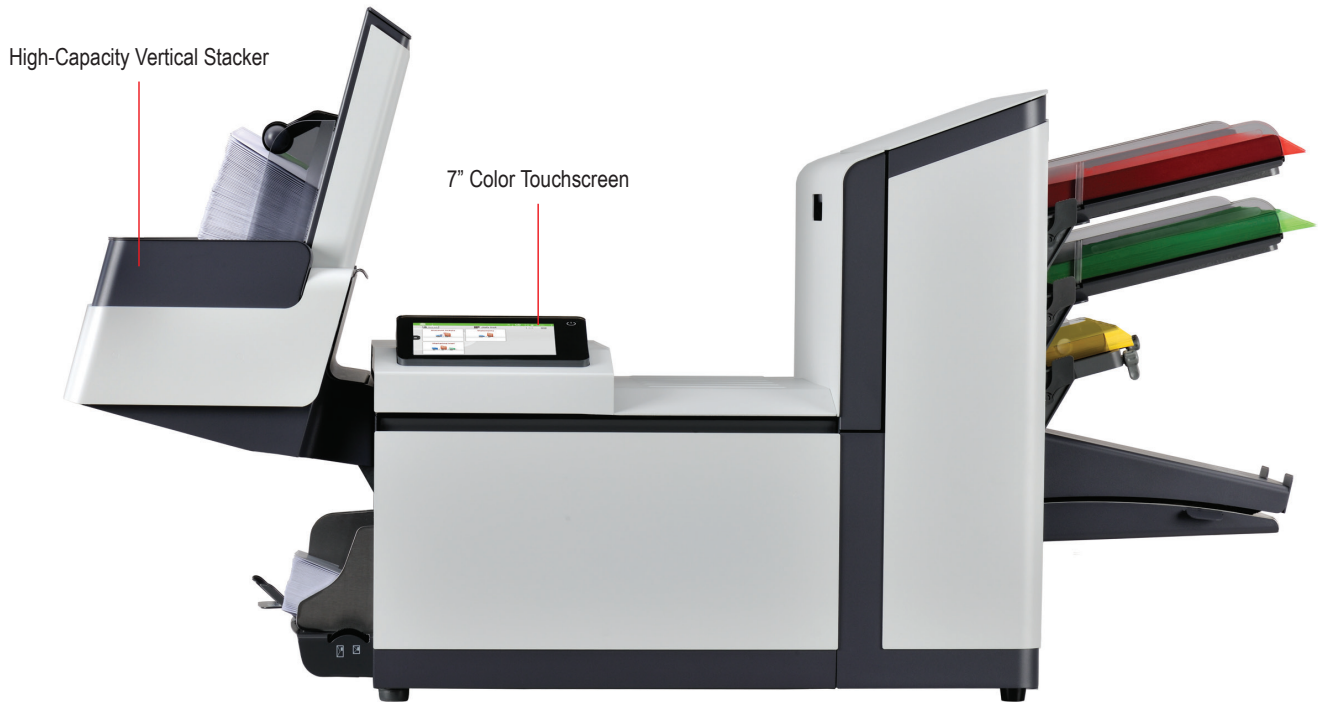
FD 6210-Advanced 2