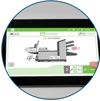
Graphics-Based Color Touchscreen Quick and easy job setup, with paper and envelope presence sensors

Four configurations are available: FD 6210-Basic 1 (one automatic sheet feeder), FD 6210-Basic 2 (two automatic sheet feeders), FD 6210-Advanced 2 (two sheet feeders and one insert/BRE feeder), and FD 6210-Special 2 (two sheets feeders and a special insert/BRE feeder). Standard features include a 7" full-color touchscreen , high-capacity vertical output stacker , automatic paper/envelope presence sensors , a top-loading envelope hopper , ECO Mode , and AutoSet™ one-touch setup. Recurring jobs run in AutoSet™ can also be stored as one of 50 programmable jobs . Options include a Productivity Package , a CIS full-width scanner , short feed trays , production feeder , side exit trays , and code reading licenses .