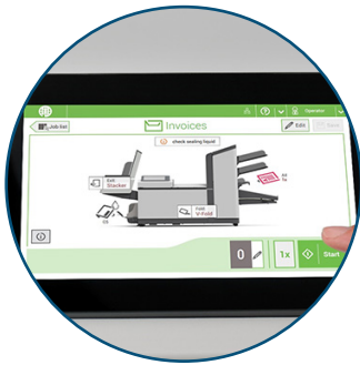
Graphics-Based Color Touchscreen Quick and easy job setup, with paper and envelope presence sensors

The 6308 Series Inserters combine user-friendly features with high productivity and are available in four configurations with standard and special feeders, and short feed trays. User-friendly innovations include a 7” full-color touchscreen control panel and the ability to store up to 50 programmable jobs . Standard features include a high-capacity vertical output stacker which holds up to 500 finished envelopes, automatic paper and envelope presence sensors with graphic indicators on the control panel, and a large top-loading envelope hopper with a capacity of up to 325 envelopes. Models with intelligence feature a full-width CIS scanner to read OMR, 1D and 2D barcodes and QR codes. Productivity enhancing options include a Production Feeder, short feed trays, Advanced OMR/BCR, MailDoc™ Software, and a side exit tray for up to 400 envelopes.