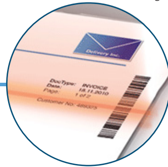
Full-Page CIS Scanner* Reads OMR, 1D, and 2D BCR codes printed horizontally or vertically