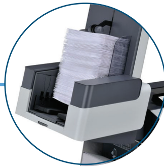
High-Capacity Vertical Stacker Holds up to 500 filled envelopes in a neat, sequential order