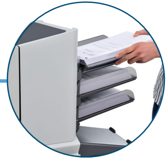
Easy-Load Document Feeders Various configurations from high capacity to short feed trays