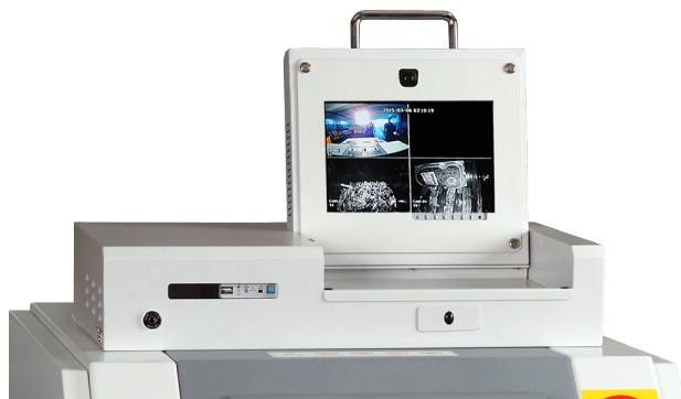
Camera Monitoring System displays and records real-time feeding and destruction of gaming materials.

1-Year Warranty on cutting head and all other parts