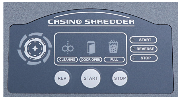
User friendly LED control panel displays real-time shredding status