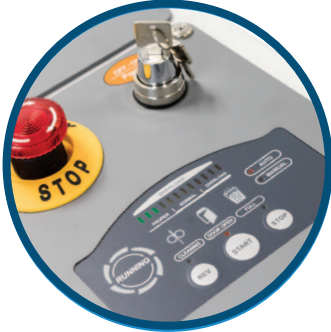
User-Friendly Control Panel: Door Open Sensor, Reverse, Waste Bin Full Indicator

The Formax FD 87HDS-R HDD / SSD Hard Drive Shredder provides the best level of security by physically destroying discarded hard drives. For optimal security and accountability, the FD 87HDS-R features a Recording System with internal and external cameras to monitor and document their destruction. Separate shredding chambers sized for 3.5" HDD and 2.5" SSD & HDD drives have sliding metal shields for safety and are designed for continuous operation . Its chain-driven AC-gear motor is housed in a solid-metal cabinet with casters for mobility and is engineered for low operational noise. Combining safety, durability, and an extra level of security, FD 87HDS-R is the best choice to protect your digital data.