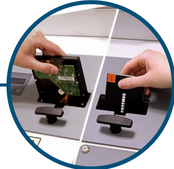
Separate Shredding Chambers: Metal safety shields for safe, continuous operation, and individual LED counters