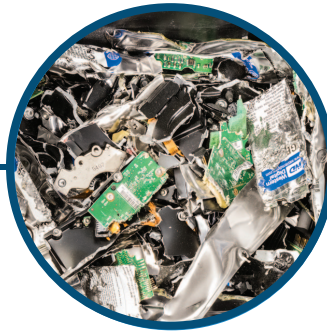
Commercial Grade: SSDs and HDDs are no match for the solid-steel blades and rugged chain-driven motor