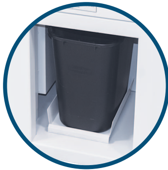
Rugged Waste Bin: Durable molded plastic for convenient collection of shredded particles