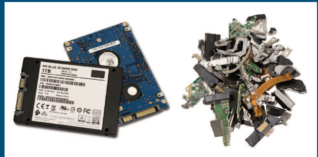
2.5" HDD & SSD Hard Drives