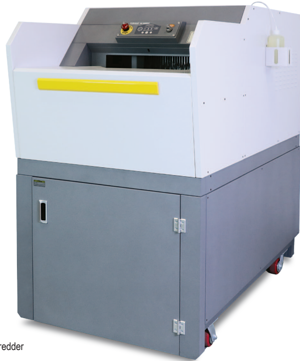
FD 8906CC Industrial Shredder