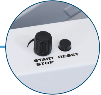
Variable Speed Control Adjustable to process a variety of different paper weights