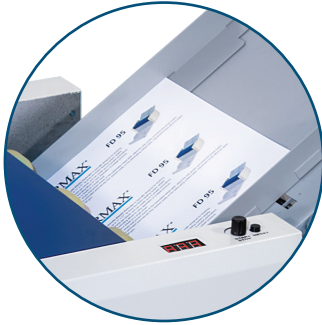
Automatic Feeding Telescoping infeed tray with adjustable side guides and three-tire feed system

The FD 95 Rotary Perforator/Creaser is specially designed to finish printed sheets, up to 13.8" x 19". Its three-tire friction feeding system reliably feeds up to 7,080 sheets per hour , and can create up to 5 parallel perforations and/or creases in a single pass . With variable speed control for different paper weights up to 180gsm, the FD 95 perforates and/or creases automatically, stacking the finished sheets neatly on the telescoping outfeed table . Standard set-up includes two perforating wheels, one creasing wheel and paper guides . Options include additional perforating sets, microperforating sets (17 tpi), creasing sets and guide strips to accommodate 55 - 60gsm paper. It's ideal for small print shops, on-demand, and in-plant finishing applications including postcards, invitations, tear-offs, brochures, billing statements, and more.