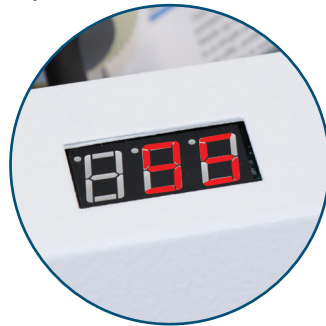
Resettable LED Counter Three-digit counter keeps an accurate tally of processed sheets