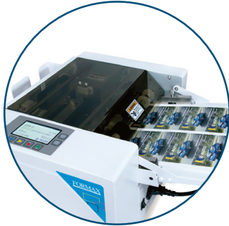
Double Friction Feed System Automatic feeding throughout job runs with interlocking plexi cover for safety

The FlashCard Business Card Cutter processes up to 144 business cards per minute . Featuring an intuitive LCD display , it's easy for operators to use one of 5 pre-programmed jobs or set up to 11 custom jobs . The infeed tray holds up to 40 sheets and can accommodate paper weights up to 350gsm. The FlashCard easily handles coated and uncoated paper, laminated sheets, and card stock. A standard 3.5" cutting cassette can be used to produce 2" x 3.5" business cards. Optional interchangeable cutting cassettes are available to produce various sizes including 5" x 7" cards, 4.25" x 8" postcards, 3.5" x 10" menu cards, and more. User-friendly features and a small footprint make this the ideal on-demand low-volume cutter.