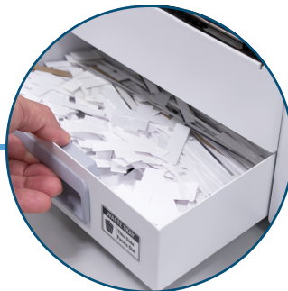
Built-in Waste Bin Collects paper scraps and is easy to access and empty