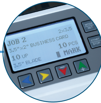
User-friendly LCD Control Panel Intuitive display allows users to select from programmed or custom jobs